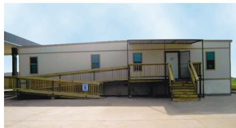
Modular S-Plex Building is shown with optional features.